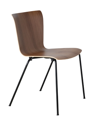
VM110 WALNUT SHELL BLACK POWDER COAT BASE